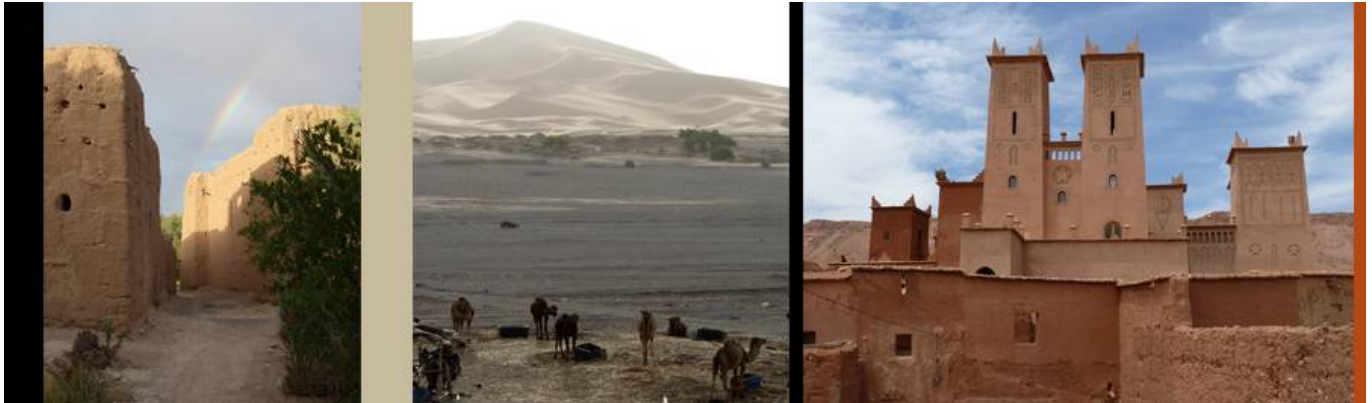
Images: Skoura oasis village; Erg Chebbi dunes; Atlas Mountains adobe village