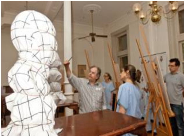
Royal Prince Alfred Hospital, Sydney